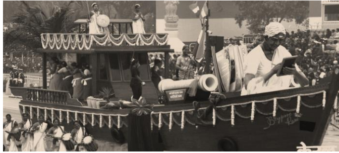
Republic Day Tableau